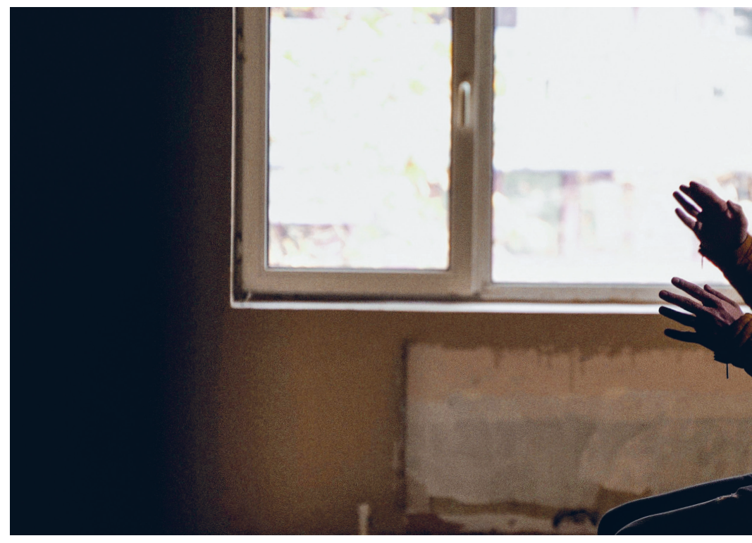
Secret believers in the Middle East rely on prayer from the global church to stay strong under persecution.

Muslim background across the Middle East Community online face persecution not only from the police and the authorities, but their own families He continues, "Community really is the key and communities too. As a consequence, word here. Having others to share your faith they hide their faith and suffer from severe isolation. Open Doors aims to connect believers online, as well as in person where possible, to help secret believers know they are not alone.