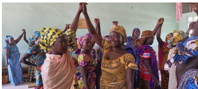
Group photo of women participating in an activity in the self-help group.