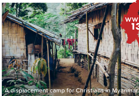
A displacement camp for Christians in Myanmar.