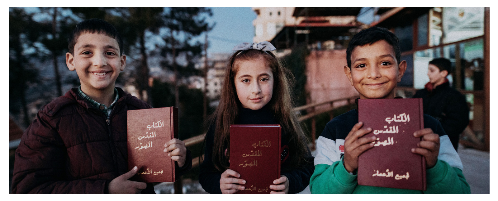
Children in Centre of Hope, Mashta Al Helou with their picture Bibles. Centres of Hope offer a brighter future to the next generation, despite the difficult struggles of their lives so far.