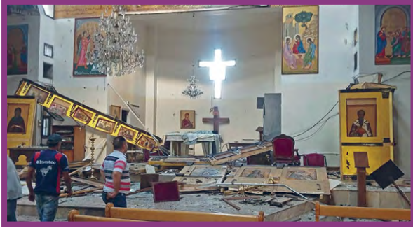
St Elias Church, in the Dweila area of Damascus, Syria, after the devastating bomb attack. 22 Christians lost their lives.