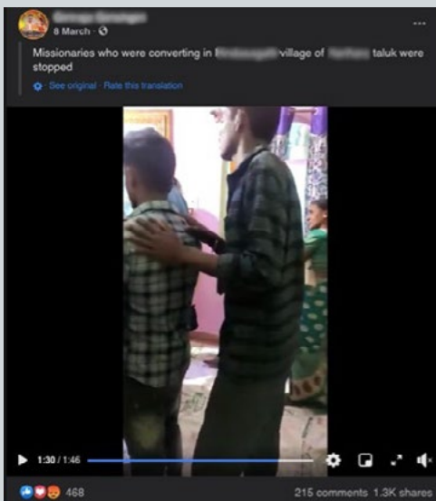
Image refers to background of anti-Christian persecution in Case Study 1. The image is sourced from the website The News Minute.com, available at: https://www.thenewsminute.com/article/bengaluru-christian-community-alleges-local-officials-removed-jesus-statue-without-cause . Copyright information about this image is unknown.